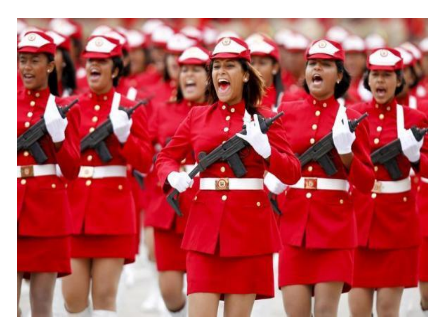
Venezuelan soldiers march during a military parade, February 4, 2012.